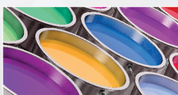
Paint & Adhesives