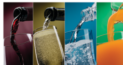
Wine & Beverages